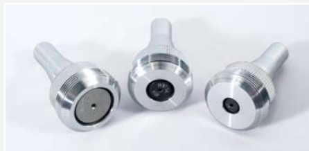
Different stylus sizes

The dot peen marking head is mounted on a solid machine table, which includes a height adjustable column frame. The respectively adjusted height is shown on the digital display. A hand wheel simplifies the setting of the correct pin position.