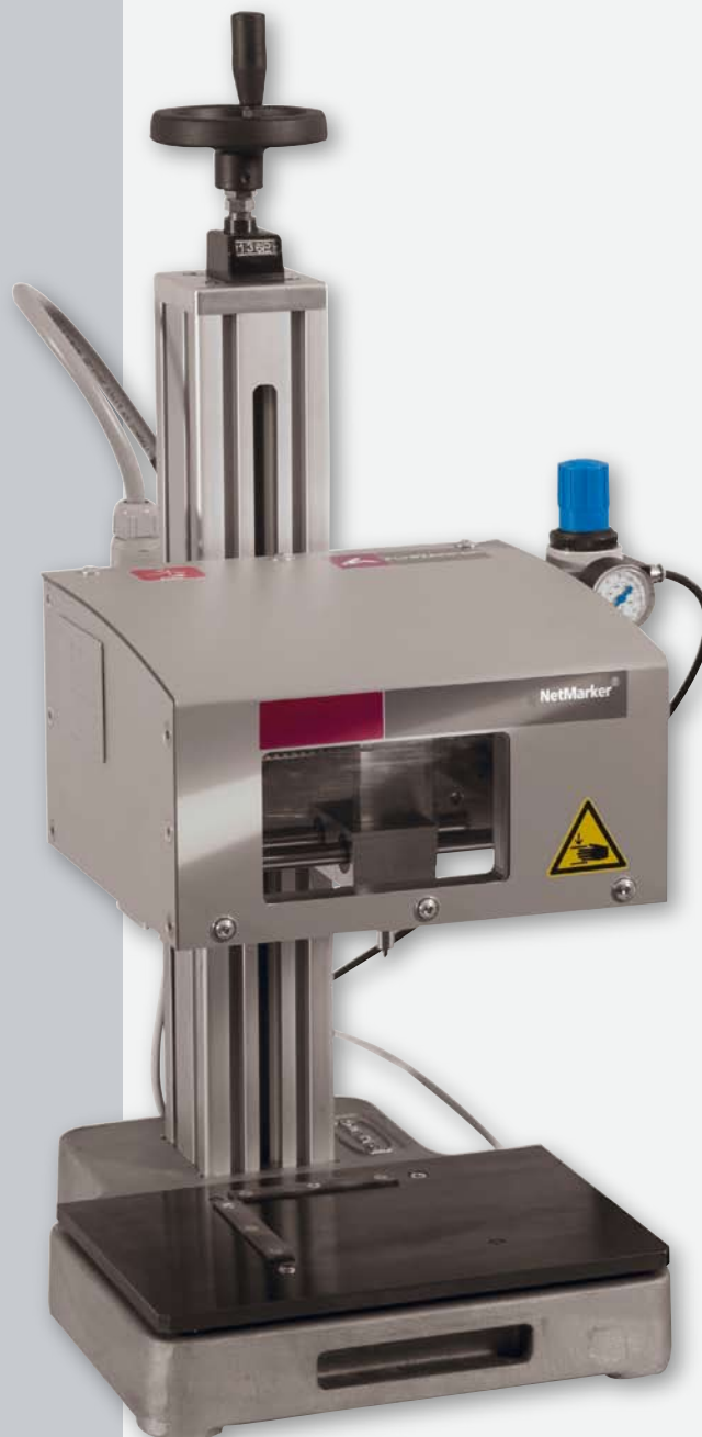
Table marking system NetMarker ®