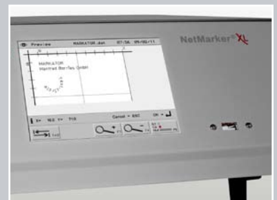
Large Colour LC Display and USB-slot on the front panel