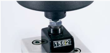
Digital height display